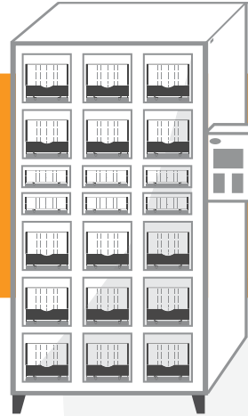
ACCESS 6521 21-Door Locker Weight: 318 kg