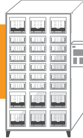
ACCESS 6527 27-Door Locker Weight: 372 kg

Width: 1295 mm Depth: 750 mm Height: 1985 mm Power: 230VAC/50Hz/1.5A 3-door compartment interiors are: 215 mm H x 254 mm W x 523 mm D 6-door compartment interiors are: 71 mm H x 254 mm W x 523 mm D